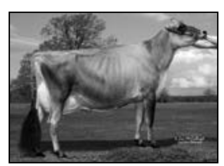
Milk-N-More WJM Connect Vivian-ET 1st 4-yr.-old cow Senior and Grand Champion