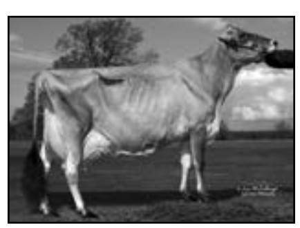
Justines Furor Julieanne-ET 1st Aged cow