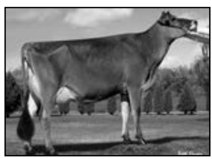
Mayerlane Brown Cow Vermouth 1st Senior 2-yr.-old cow